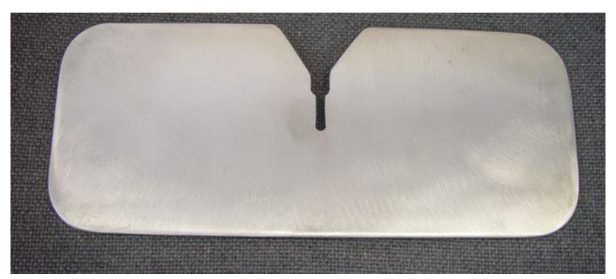
The photo of the packing mat

Press the pilot chute, release the pilot chute canopy material and secure the compressed pilot chute in the specified position by means of auxiliary packing needle. Place the released material of the pilot chute canopy by means of specified method on the pilot chute periphery. Secure the auxiliary packing cord and the pilot chute with the packing part of the reserve parachute by means of suitable method on the packing mat.